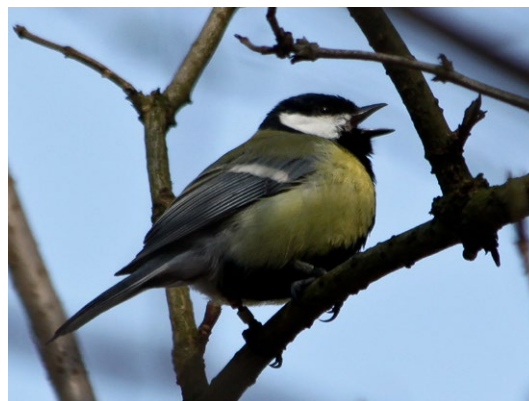
FIGURE 1 A singing male great tit ( Parus major )

We here used the novel automatized wireless Encounternet tracking technology (Mennill et al., 2012; Rutz et al., 2012; Snijders et al., 2014) to experimentally study the spatial behavior of male and female great tits ( Parus major ; Figure 1) in response to the vocal interaction between a neighboring resident and a simulated territory intruder. We simulated territory intrusions by playing the song of an unfamiliar male in the territories of male great tits. Subsequently, we monitored the spatial response of the surrounding male and female conspecifics in relation to specific vocal responses of the territory owner. As a strong vocal response commonly indicates that the resident male is in a good condition (Buchanan, Spencer, Goldsmith, & Catchpole, 2003; Gil & Gahr, 2002), we expected sex-dependent responses with females to be more attracted to stronger vocal responders and males to be more repelled. We investigated three spatial measures in specific: (1) the minimum approach distance of the closest male and female to the intrusion site, (2) the number of male and female connections in the close-range social network of the vocal responder, and (3) the average duration of these connections. We used these different measures to distinguish between eavesdroppers responding solely to the signal, for example, to sample a potential (extra-pair)